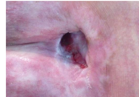
SCX: 14 days later