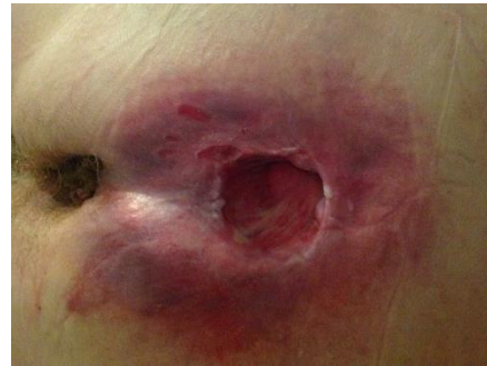
SSD: 14 days later