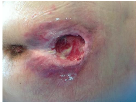
Beginning of the study